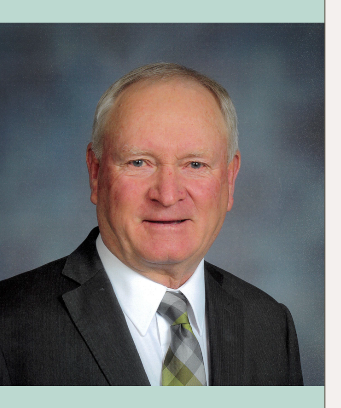
Mayor Rod Westbroek