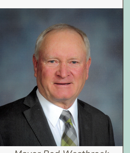
Mayor Rod Westbroek Mayor's Message

I just spent hours looking at videos of old family movies taken of family get togethers at Christmas and Thanksgiving. They were movies of my parents and grandparents and were probably taken in the 1950s. Things have changed in so many ways. The 50s were a time when families were big and homes were small. Whether our house is big or small, it is where we live with those we love and create memories. It is our home.