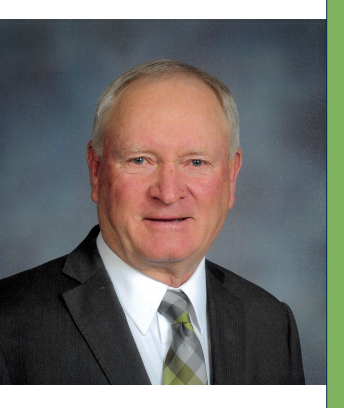
Mayor Rod Westbroek