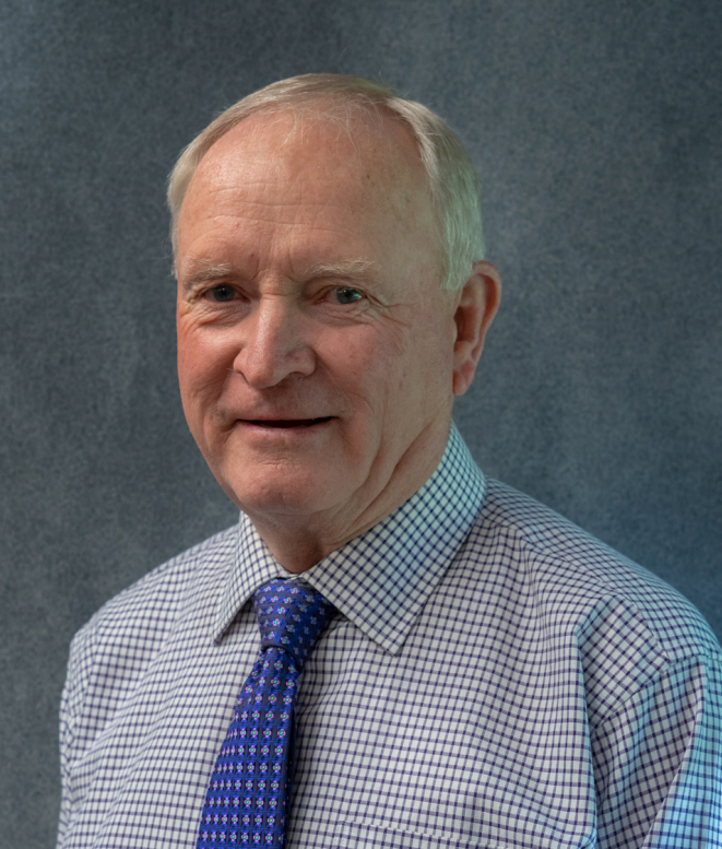
Mayor Rod Westbroek